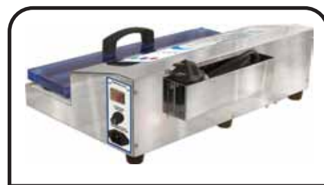
Detachable Power Cord and Convenient Storage Compartment